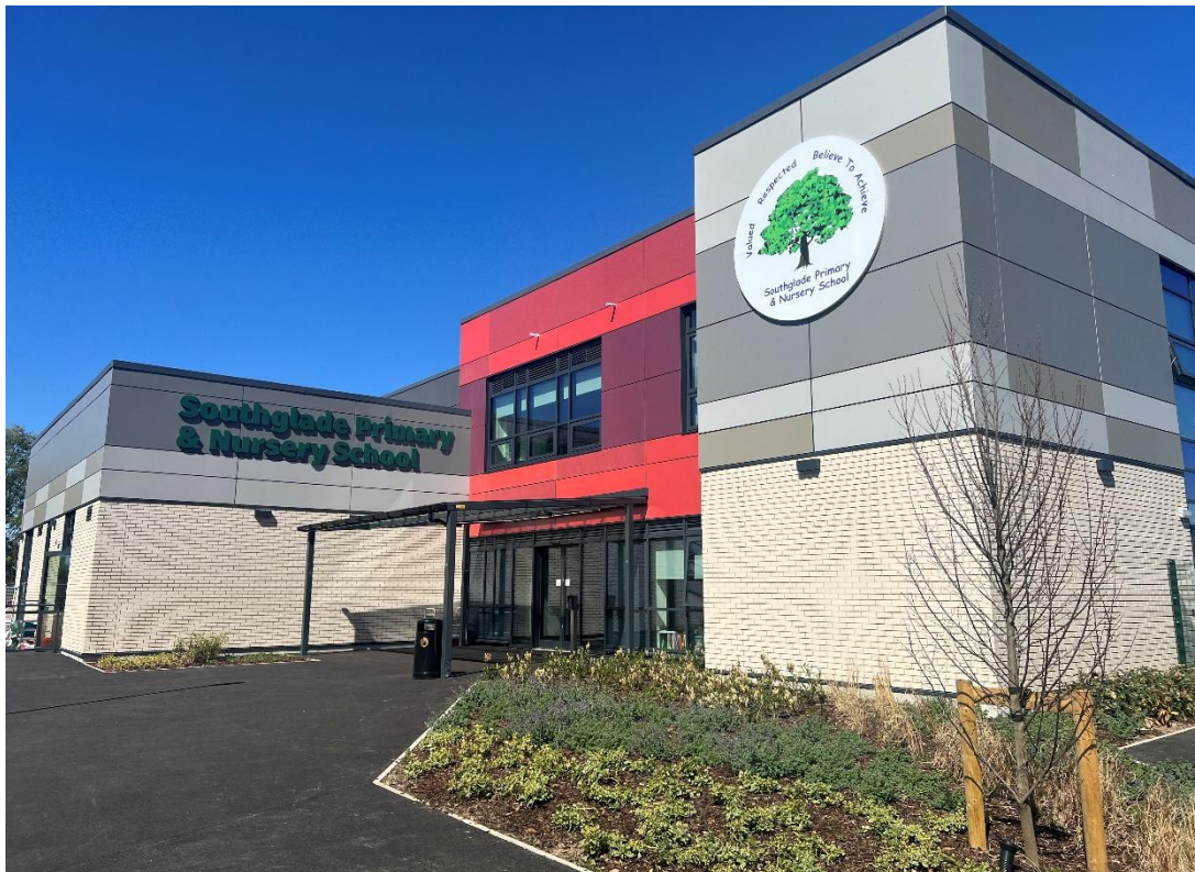
Southglade Primary and Nursery School