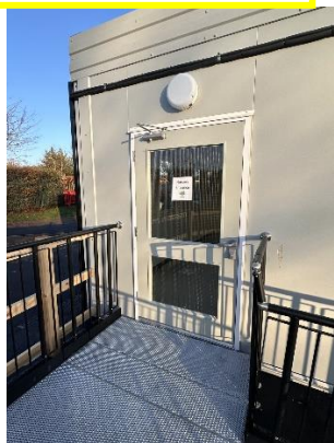
Entry via Beckhampton Road