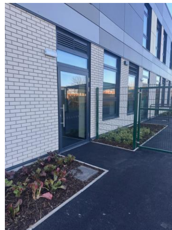
Nursery doors in the new building

Southglade Primary and Nursery School is committed to safeguarding and promoting the welfare of children and young people and expects all staff and volunteers to share this commitment.