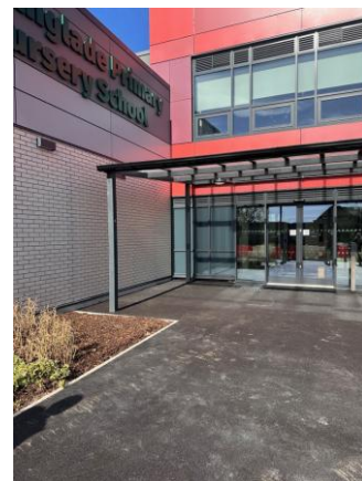
Canopy where 3ES will be collected.

Southglade Primary and Nursery School is committed to safeguarding and promoting the welfare of children and young people and expects all staff and volunteers to share this commitment.