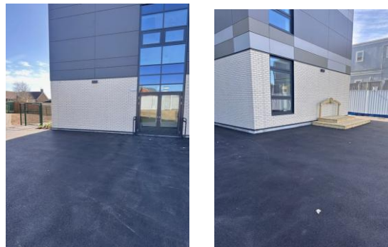
Year 5 collection areas

Southglade Primary and Nursery School is committed to safeguarding and promoting the welfare of children and young people and expects all staff and volunteers to share this commitment.