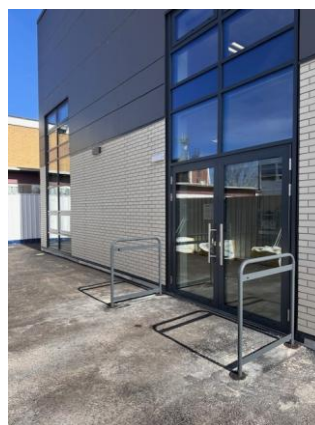
Breakfast club door in the new building

Southglade Primary and Nursery School is committed to safeguarding and promoting the welfare of children and young people and expects all staff and volunteers to share this commitment.